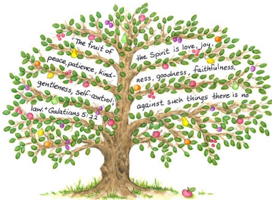
"The Fruit of The Spirit"